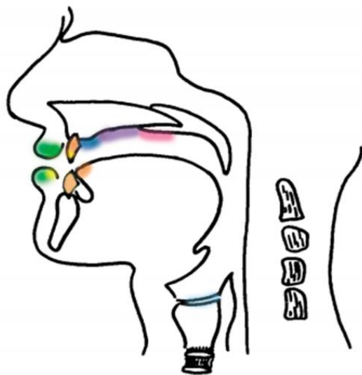
Normal Place of Articulation